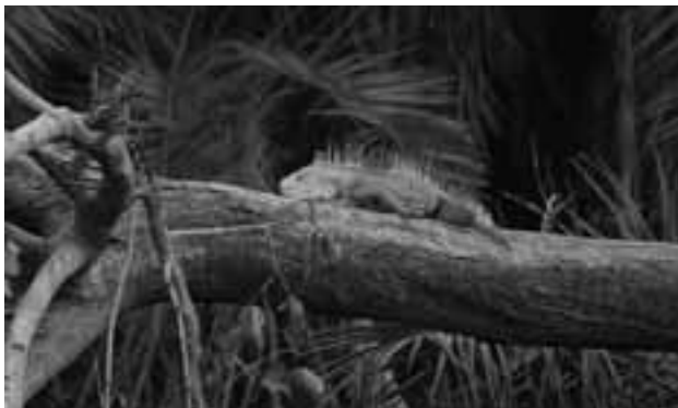
KEVIN M. ENGE

Adult male Green Iguana ( Iguana iguana ) basking on a fallen tree during a cool day at Crandon Park on Key Biscayne, Miami-Dade County, Florida (photographic voucher UF 150121). Non-native Senegal Date Palms ( Phoenix reclinata ) can be seen in the background.