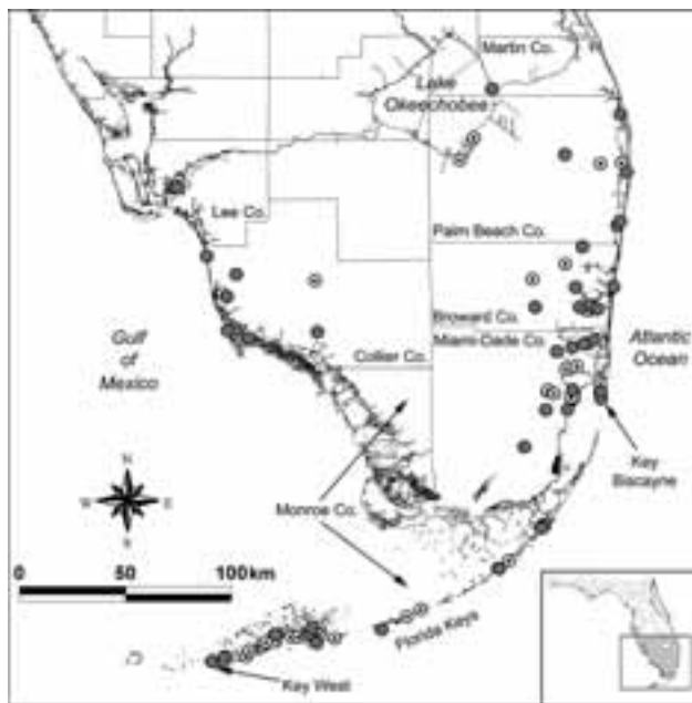
Records (N = 3,169) of Green Iguanas ( Iguana iguana ) in southern Florida. Open circles indicate preserved specimens and photographic vouchers (N = 1,088) collected between 1965 and 2006, circles with central dots indicate observations (N = 2,081). A dot may represent more than one record.

Neonate and juvenile Iguana iguana feed on vegetation (i.e., new shoots, leaves, blossoms, and fruits) and insects such as grasshoppers (Hirth 1963). In addition to these items, adults have been reported to feed on bird eggs (Lazell 1973) and carrion (Loftin and Tyson 1965). In Florida, neonates and juveniles feed on vegetation, insects, and tree snails (Townsend et al. 2005), whereas adults are primarily herbivorous, but may take additional items as well. A juvenile I. iguana appeared to be feeding on Firebush ( Hamelia patens ) fruits in a Naples garden (J. Schmid, pers. comm.). Fecal contents of a Homestead, Florida individual included flowers, leaves, and fruits from non-native Jasmine ( Jasminum sp.) and Washington Fan Palms ( Washingtonia robusta ; Meshaka et al. 2004b). At Bill Baggs Cape Florida State Park (BBCF) on the southern tip of Key Biscayne, we have observed I. iguana feeding on Nicker Bean ( Caesalpinia bonduc ),